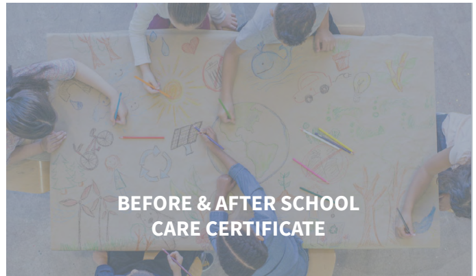
BEFORE & AFTER SCHOOL CARE CERTIFICATE