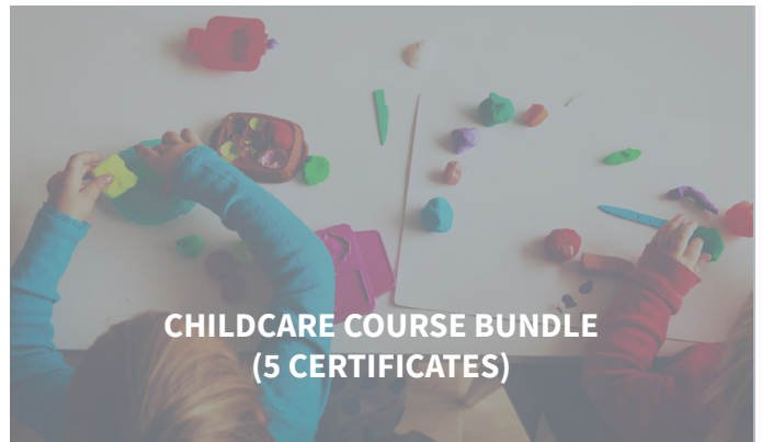
CHILDCARE COURSE BUNDLE (5 CERTIFICATES)