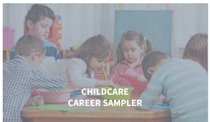
CHILDCARE CAREER SAMPLER