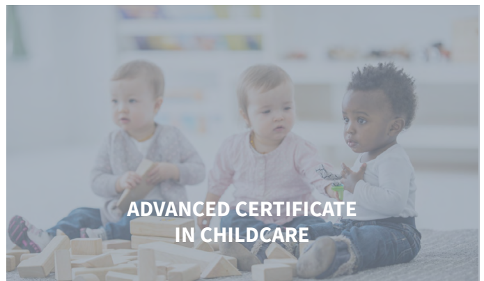
ADVANCED CERTIFICATE IN CHILDCARE