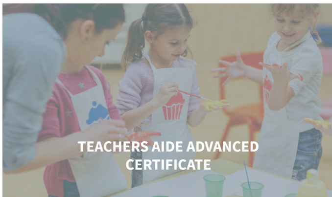
TEACHERS AIDE ADVANCED CERTIFICATE