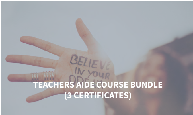
TEACHERS AIDE COURSE BUNDLE (3 CERTIFICATES)

Checkout our recommended Course Bundles and Certificate Courses, created by combining Micro-Credential (topics) available in this category library.