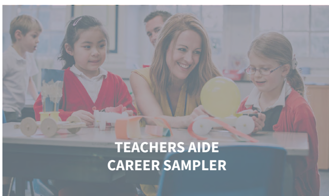
TEACHERS AIDE CAREER SAMPLER