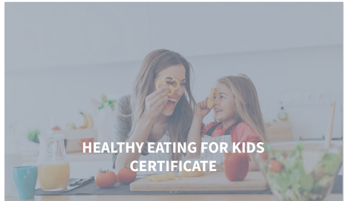
HEALTHY EATING FOR KIDS CERTIFICATE