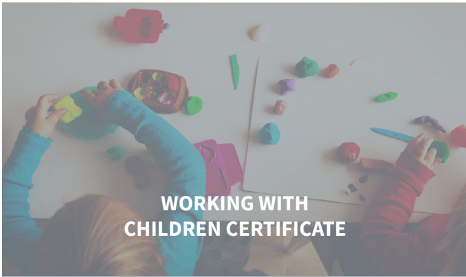
WORKING WITH CHILDREN CERTIFICATE