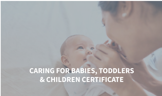
CARING FOR BABIES, TODDLERS & CHILDREN CERTIFICATE